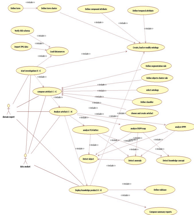
Fig. 1. Business use case diagram of CORDIET.